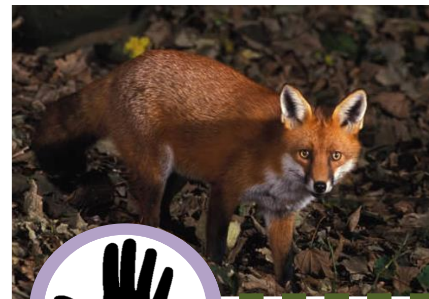
Sionnach / Madra Rua Fox

species of mammal in Ireland (land, sea & air)