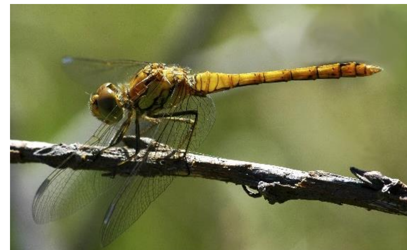
Snáthaid Mhór Dragonfly