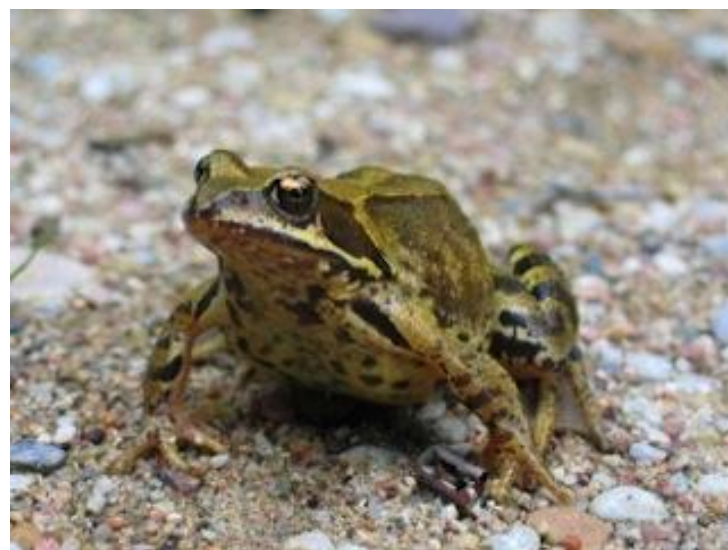
Frog Common Frog