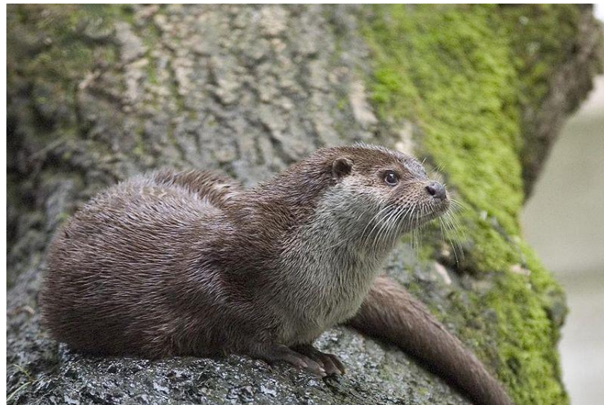
Madra Uisce Otter

Lives in a "Sett" and eats worms... up to 200 per night! There are around 250,000 in Ireland.