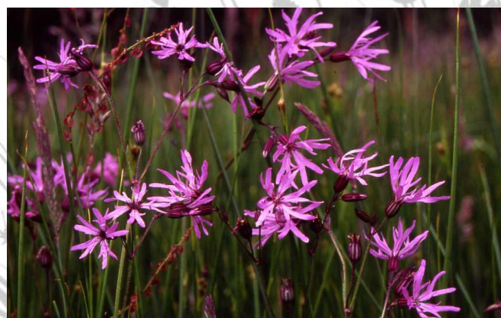
Lus síoda Ragged Robin