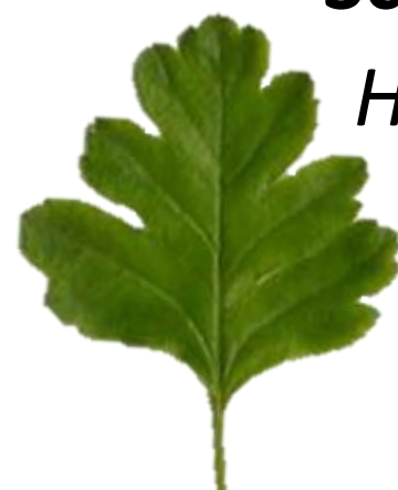
Sceach gheal Hawthorn